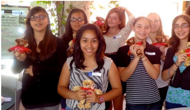
Tech Trek Girls 2013