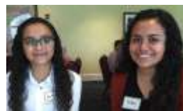
Tech Trek Girls