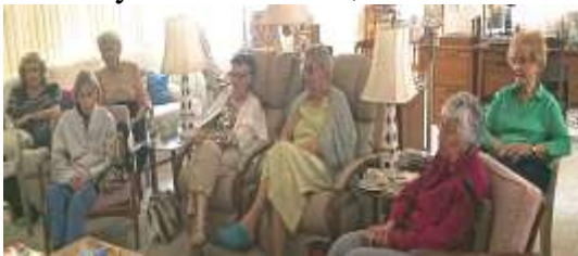
Photo from February meeting.

In April the group will discuss Lean In by Sheryl Sandberg