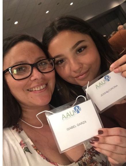
Mother & Daughter

AAUW-CA Tech Trek 20 th Tech Trek Anniversary April 2018